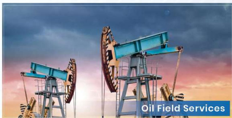
Oil Field Services