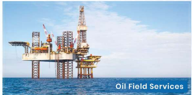
Oil Field Services